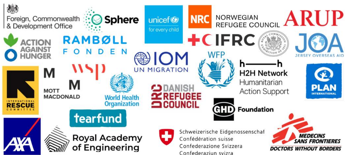
Figure 1. Some recent RedR UK partners.

RedR has over four decades of experience in disaster response, responding to major disasters since our founding in 1980 including the 2004 Boxing Day tsunami, the 2010 and 2021 Haiti earthquakes, the 2013-16 Ebola crisis in West Africa, ongoing Syrian crisis, Cyclone Idai in Mozambique, war in Ukraine, and 2023 earthquakes in Türkiye and Syria. Through an agile and collaborative approach, we ensure that learning interventions are tailored, responsive, and impactful, engaging in regular feedback loops and capacity assessments to refine and enhance our training offerings.