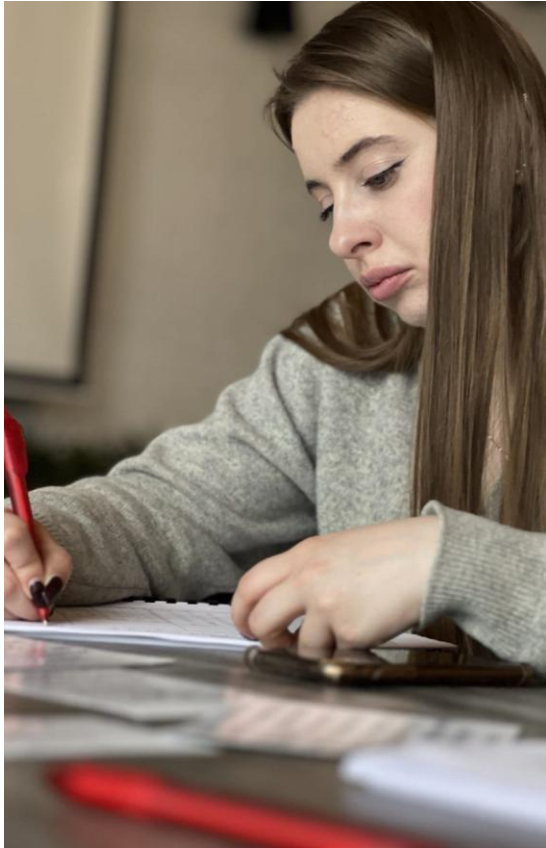
4 Participant of Project Cycle Management in Lviv, April 2023.

participants to develop logical planning frameworks, manage resources effectively, and navigate financial challenges with confidence. With a strong emphasis on accountability and quality assurance, this course prepares participants to deliver quality outputs on time, even under the most challenging circumstances, ensuring the successful implementation of humanitarian projects.