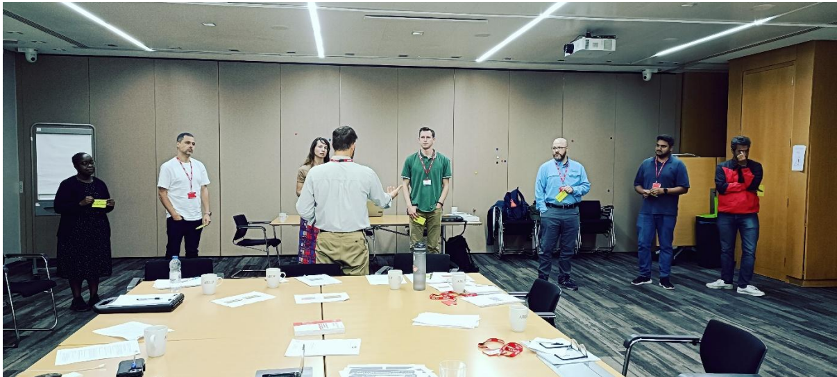
7 Participants from Security Management for Humanitarians in London, June 2023.