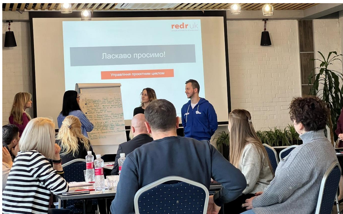
15 Participants from Advanced Project Cycle Management in Lviv, April 2023.