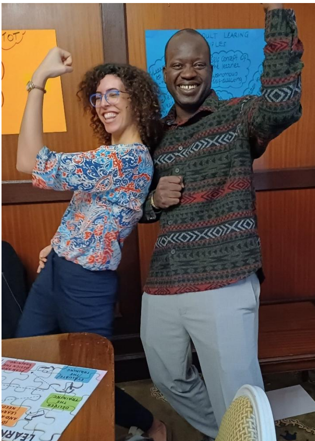
3 Participants of Training of Trainers in Nairobi, October 2023.

Leadership and Management is tailored to enhance the leadership skills of humanitarians occupying management or coordination positions. Drawing upon cutting-edge research from authorities like ALNAP, it delves into the essential skills necessary for effective leadership. Each session amalgamates theoretical insights with practical exercises, providing participants with a structured environment to hone their abilities. Throughout the course, an ongoing case study serves as a platform for trainees to apply their leadership skills in realistic scenarios, allowing them to navigate challenges akin to those faced by senior team members during humanitarian emergencies. Additionally, the course offers participants a chance to reflect on their individual leadership capabilities and devise a personalized development plan through supportive peer coaching.