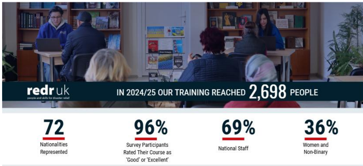
Figure 2. RedR impact 2024/25.

Our services invest in people. We strongly believe that developing staff skills, capabilities, well-being, and motivation is critical to performance and organisational success. We strive to deliver structured and tailored training, provide tools, templates and follow up action to enable staff to grow independently in their roles. In 2024/25, RedR trained 2,698 responders from 72 nationalities through 165 world-class learning events (Figure 2).