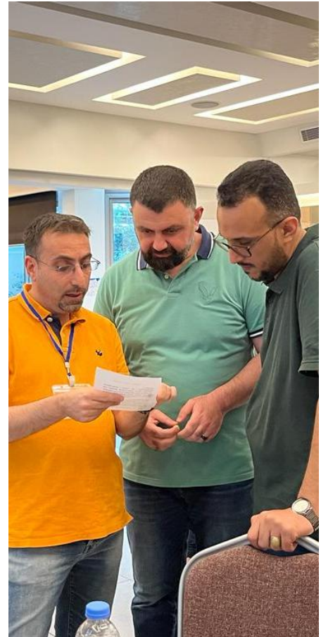
Figure 1 Essentials of Humanitarian Practice participants in Beirut, September 2023.