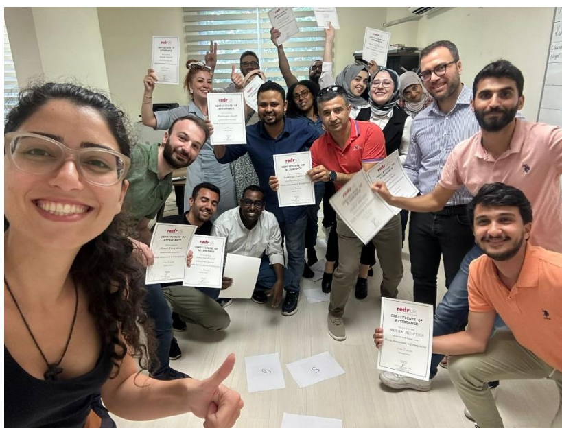
6 Participants from Needs Assessments in Emergencies in Gaziantep, July 2023.

RedR UK's Rapid Needs Assessment in Emergency training course offers valuable insights into factors influencing behaviours during emergencies and strategies to mitigate risks for vulnerable populations. The course aims to foster participants' abilities to conduct and assess rapid needs assessments within humanitarian and development contexts. Using active and participatory learning methods, it seeks to provide participants with a comprehensive grasp of pertinent assessment principles and tools, enabling them to effectively apply these in real-world scenarios.