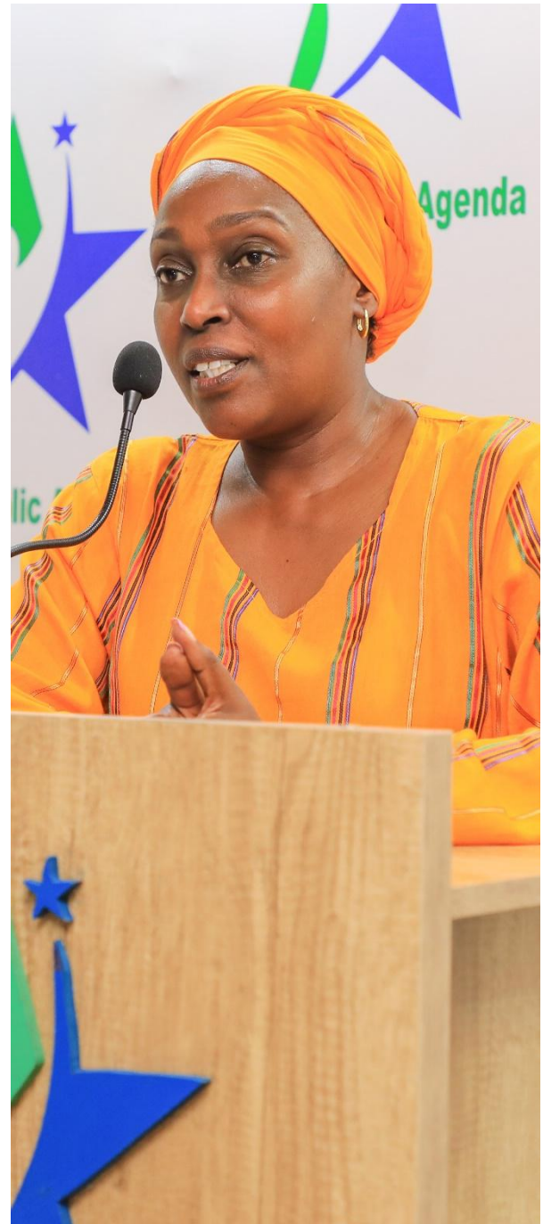
2 Participant from Training of Trainers in Mogadishu, September 2023